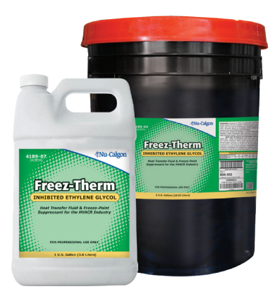
96% Ethylene Glycol