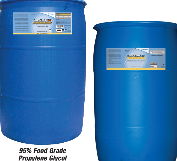
35% Propylene Glycol for Secondary Cooling Systems