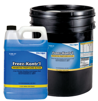
70% Propylene Glycol