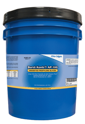
For Aluminum Heat Exchangers

^1\text{Maximum} corrosion weight loss as specified by ASTM D3306. ^2\text{Maximum} corrosion as specified by JIS K2234 type ^7\text{B}^{\prime\prime}