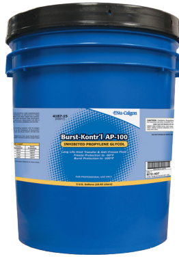
For Aluminum Heat Exchangers