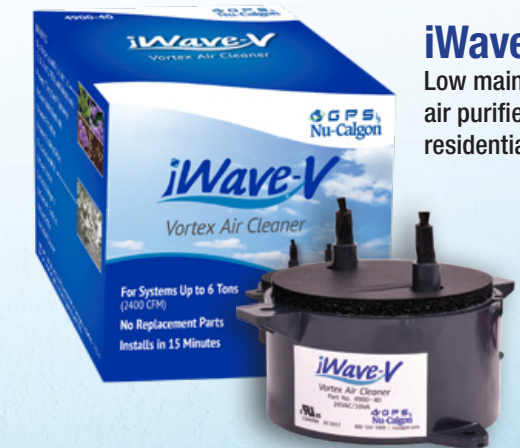
iWave-V Low maintenance air purifier for residential systems