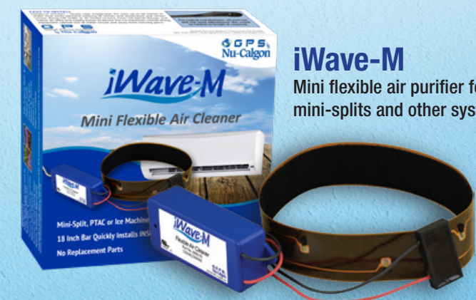
iWave-M Mini flexible air purifier for mini-splits and other systems