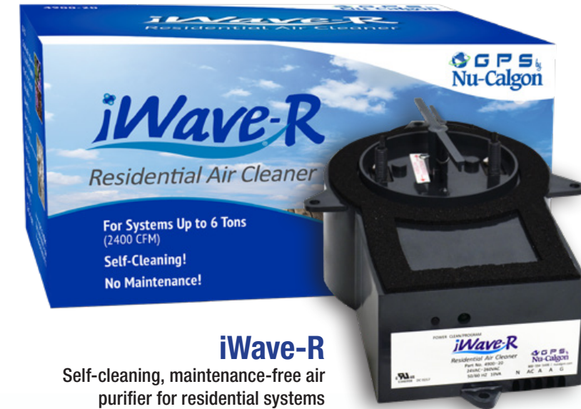
iWave-R Self-cleaning, maintenance-free air purifier for residential systems