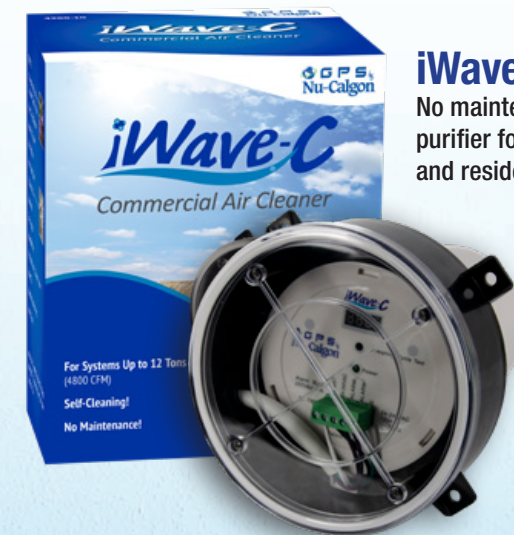
iWave-C No maintenance air purifier for commercial and residential systems