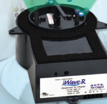
iWAVE ION GENERATOR

Are members of your family more susceptible to allergies or viruses in your home? iWave reduces allergens and kills mold, bacteria and viruses.