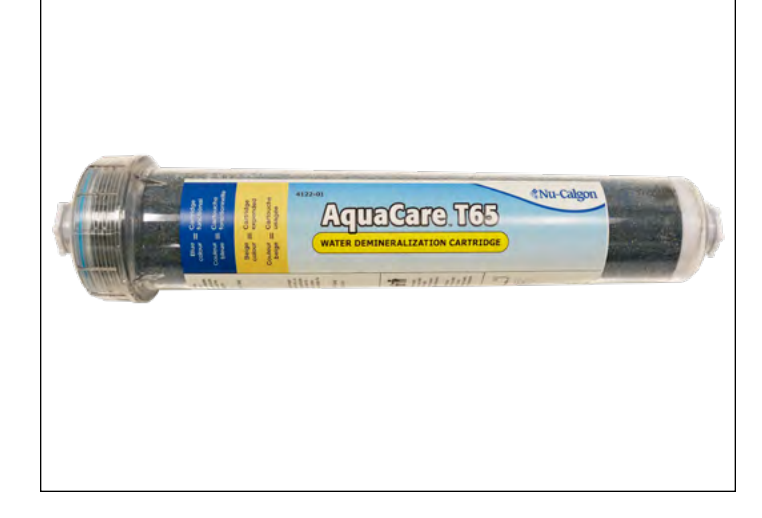
Figure 1. 140°F (60°C) max 100 psi (6.8 bar) max