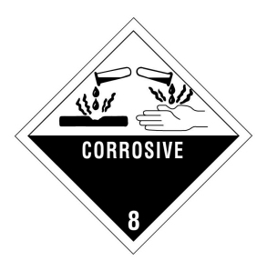
IATA; IMDG; TDG