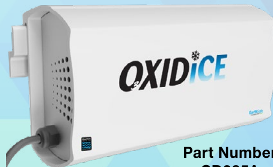
Part Number CD385A

#169 = Minimum food protection and sanitation requirements for special purpose food equipment and devices