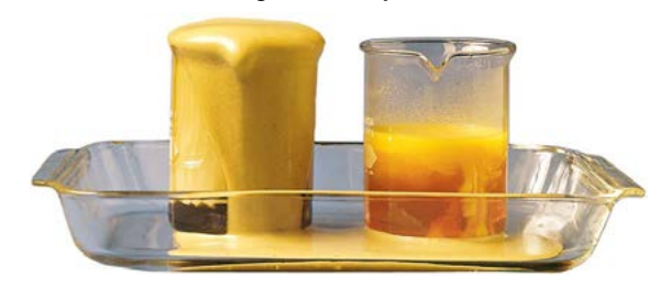
Competitive Product with Dangerous Foam

To demonstrate its capability as a low-foam product, Liquid Scale Dissolver was added to a beaker containing lime scale. A leading competitive hydrochloric acid based product was added to another beaker containing an equal amount of lime scale. The difference is dramatic. When cleaning towers and evap condensers, low-foam is the preferred approach as high foam is both dangerous to personnel and surroundings and it represents wasted acid.