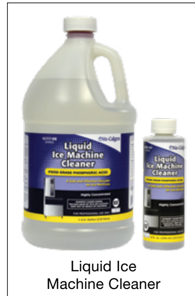
Liquid Ice Machine Cleaner