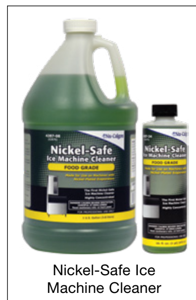
Nickel-Safe Ice Machine Cleaner

* Nickel-Safe Ice Machine Cleaner is OEM Approved.